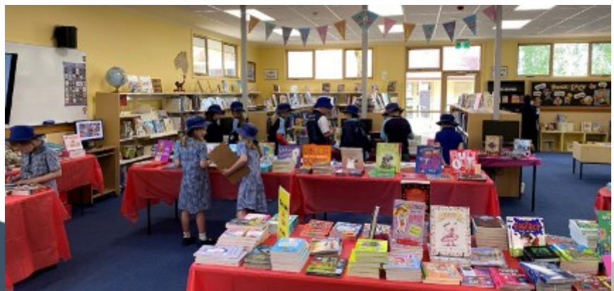
Last year's Book Fair.